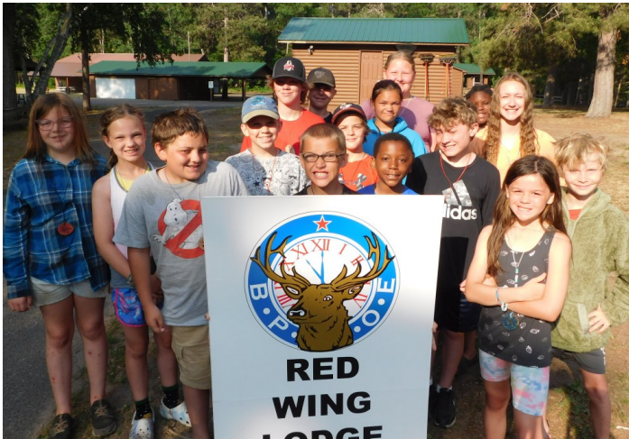
Picture of the kids sent by RW Elks 845 at the MN Elks Youth Camp - They had an AWESOME week!

THANK YOU ELKS ADVERTISERS: See more on the next page!